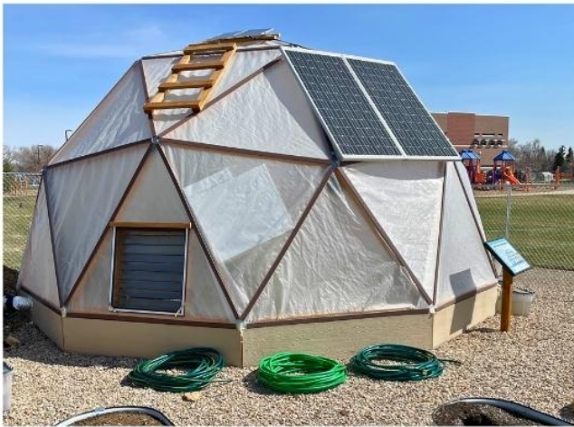
Meadowlark Garden Upgrades, $962