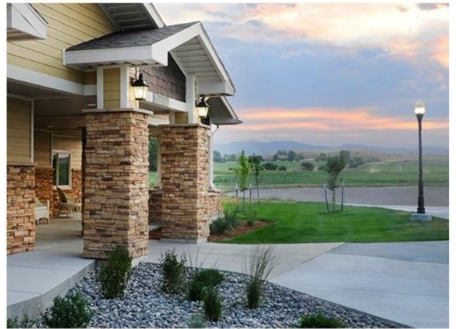
Green House Living for Sheridan Greenhouse, $1,000