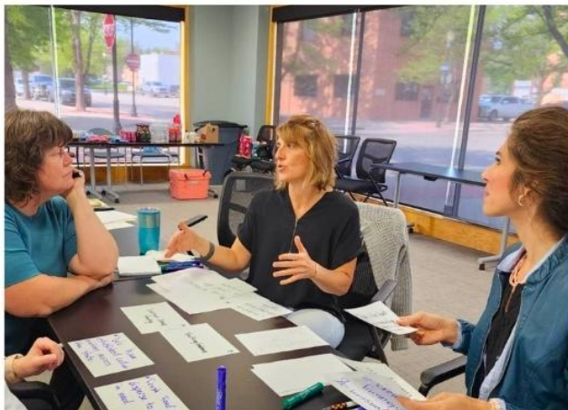
Strategic planning session in May, 2023

The 2023-26 Strategic Plan sets out three new directions