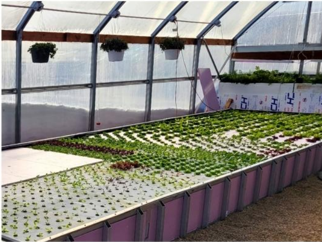
SCSD2 Fifth St. Pilot Project, $2,000