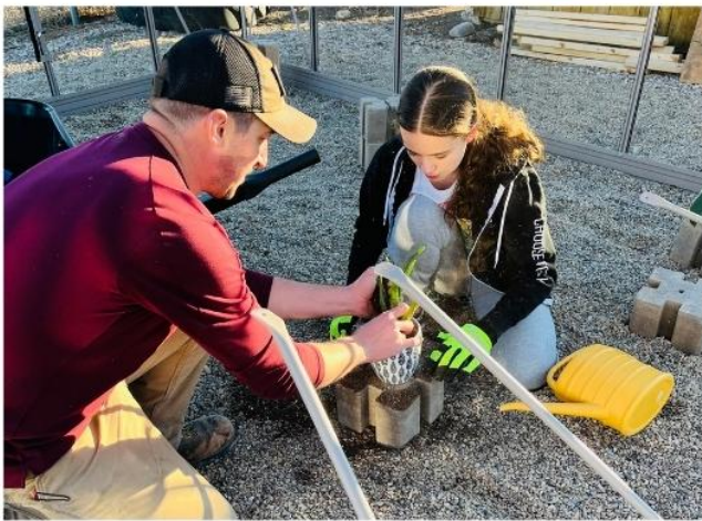
Evanston Youth Club Greenhouse, $1,000 Uinta County